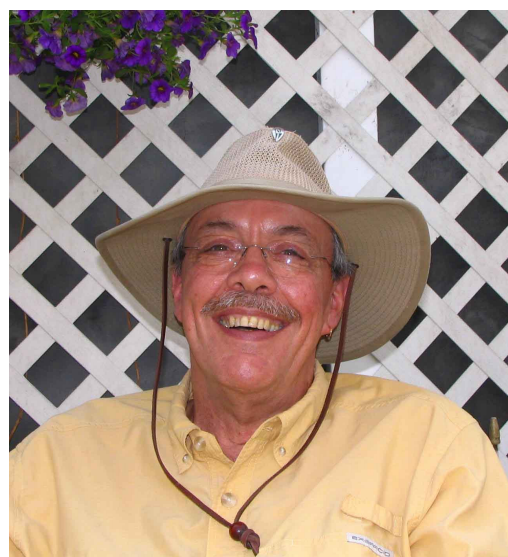
Higher Mileage Art -- 2007